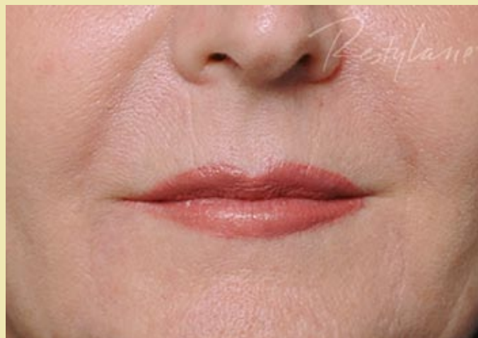
After treatment with 2 Restylane® 1 mL syringes Individual results may vary.