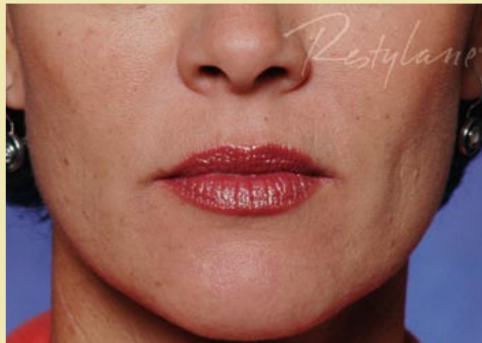
After treatment with 2 Restylane® 1 mL syringes Individual results may vary.