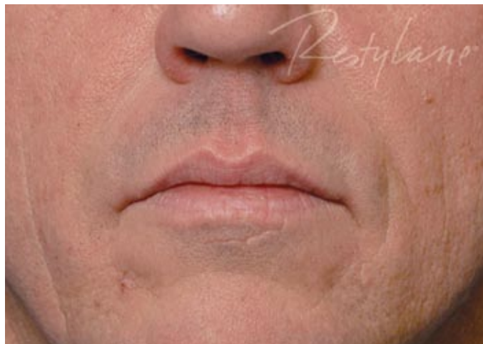
After treatment with 2 Restylane® 1 mL syringes Individual results may vary.