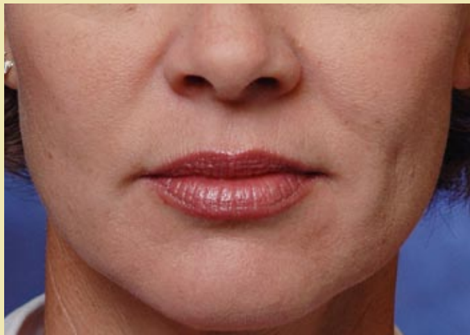
Before treatment Nasolabial folds