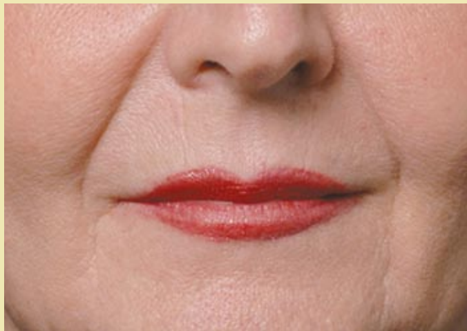
Before treatment Nasolabial folds